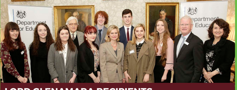
LORD GLENAMARA RECIPIENTS