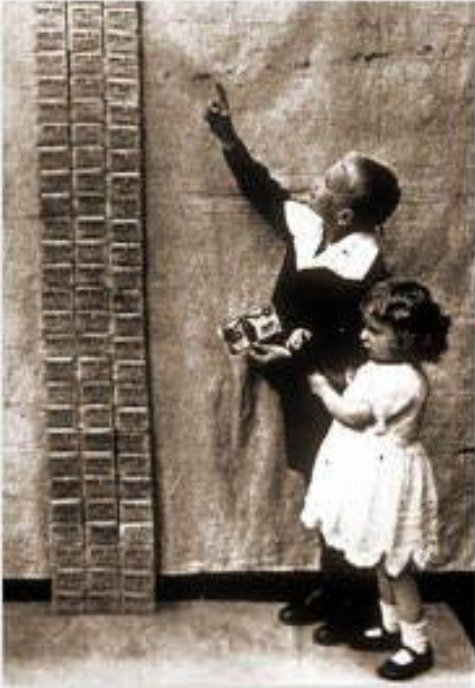
Children playing with blocks of money

The war effort required unprecedented levels of government spending, in order to support this the German government decided to increase their borrowing from other countries and to print more money. This meant that government debt grew and the value of the currency fell. This was very risky and when Germany lost the war it meant they were in a financial crisis. As the value of the currency kept falling (inflation) and it went unchecked it led to hyperinflation. At this time money lost its meaning as prices soared. Workers collected their wages and salaries in wheelbarrows and shopping baskets and tried to spend their money immediately before prices rose again. In January 1923 a kilo loaf of bread cost 163 marks, by October the price rose to 9 million marks and by 19 th November it had risen again to 233 billion marks!