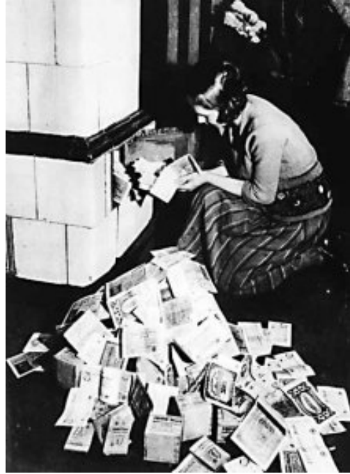
A woman burning money for her fire because it was cheaper than wood or coal!