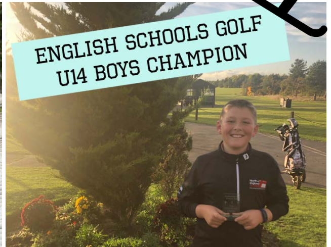
ENGLISH SCHOOLS GOLF U14 BOYS CHAMPION